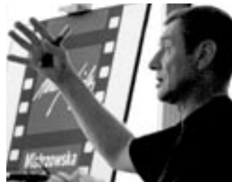
^ ESoDoc workshop 2004