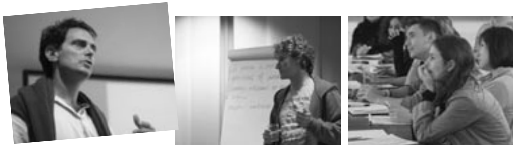
^ ESoDoc workshop 2007

ESoDoc offers three 1-week workshops held over a 6-month period. During this period participants, either individually or in groups, will develop projects based on specific social documentary themes. On-going tutorial assistance is offered over the whole period and the projects are presented at the final pitch.