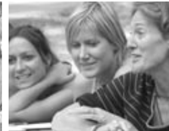
^ ESaDoc workshop 2007